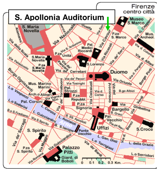
Auditorium S. Apollonia - Via San Gallo, 25