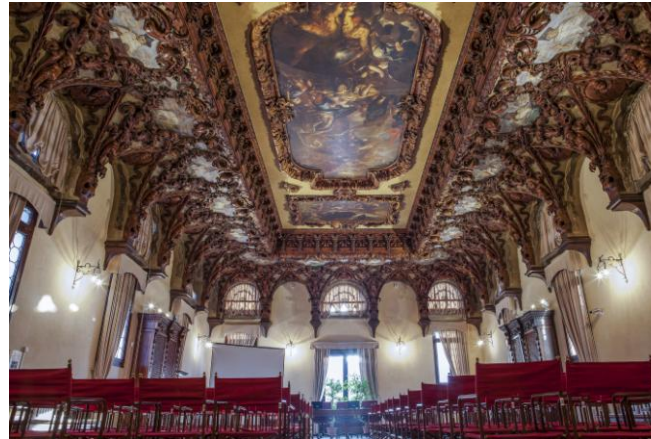
Auditorium San Domenico, Scuola Grande di San Marco Campo Santi Giovanni e Paolo Venice - Italy