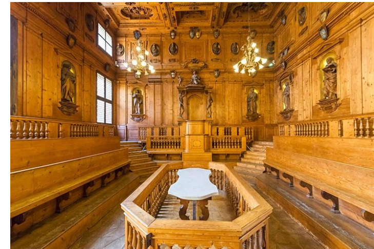
Anatomical Theatre, 1637 – Archiginnasio Public Library