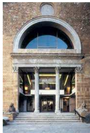
Museo Marino Marini