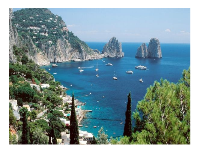
Hotel La Palma Capri, Naples - Italy